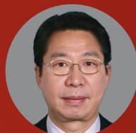
Shen Changyu 申長雨

China National Intellectual Property Administration 中華人民共和國國家知識產權局